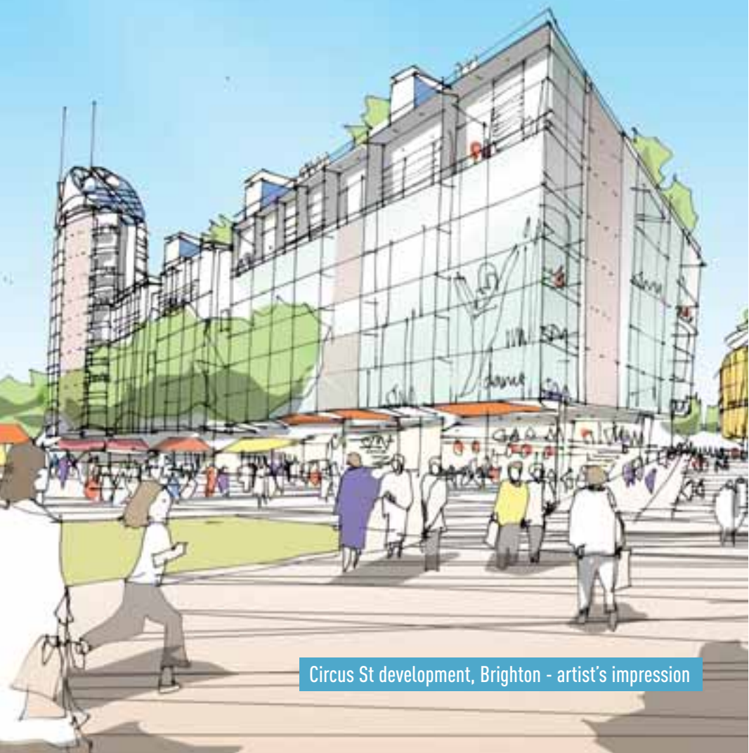
Circus St development, Brighton - artist's impression

A dance space in Brighton & Hove will provide the home for dance needed to complement the growing network of dance artists, choreographers and wider dance communities in the South East region